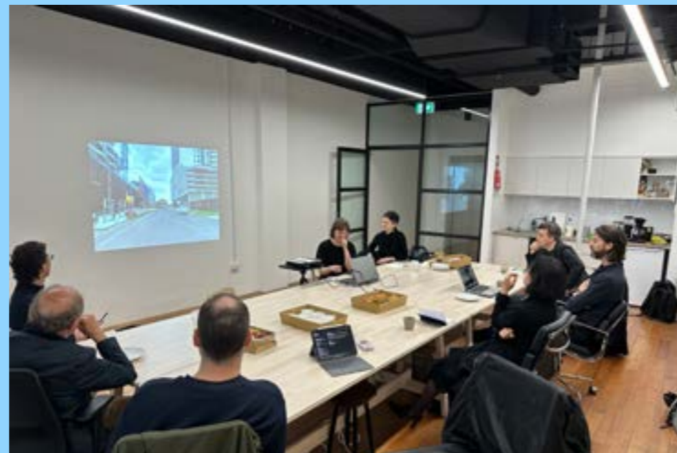
Practice Forum (for industry supporters) Every two months