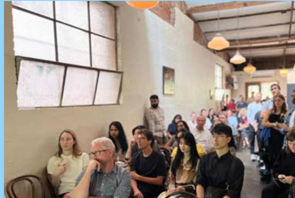
Forum Forum (for members) Every two months