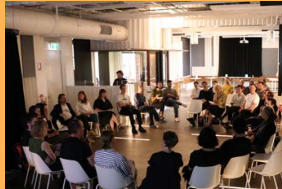
Public Works - The Upstream Designer March 2022