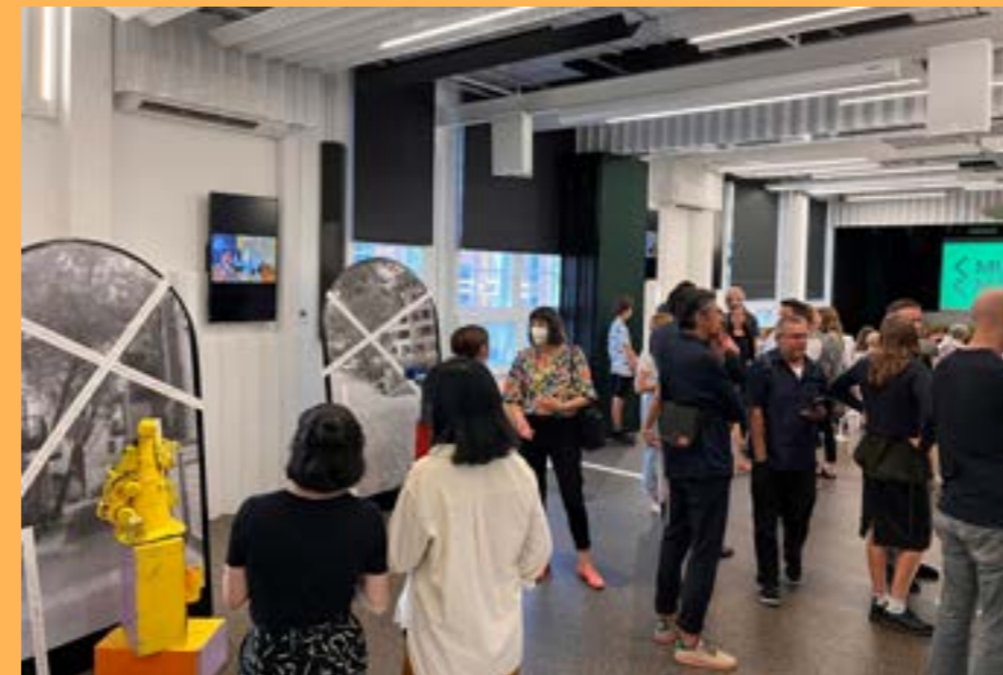
Melbourne Design Week - DIY Neighbourhood March 2022