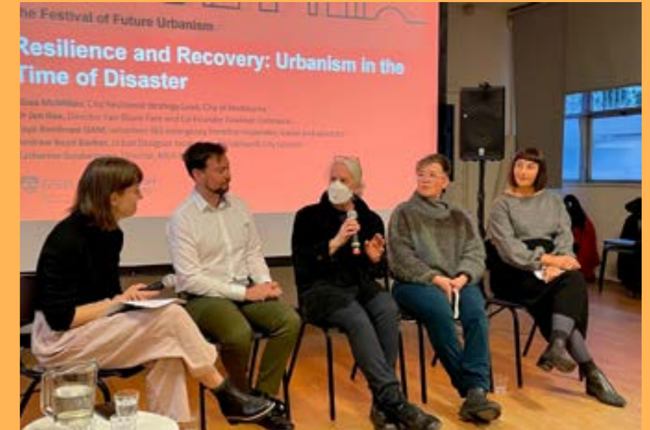
Festival of Urbanism - Resilience and Recovery September 2022