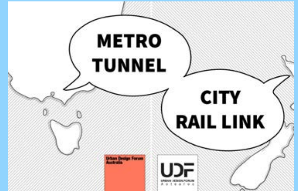
Urban Design Forum Aotearoa & Australia October 2022