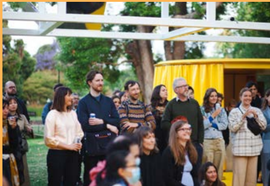
MPavilion - What Cities Need Now December 2021